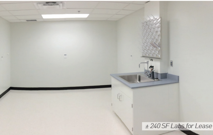
± 240 SF Labs for Lease